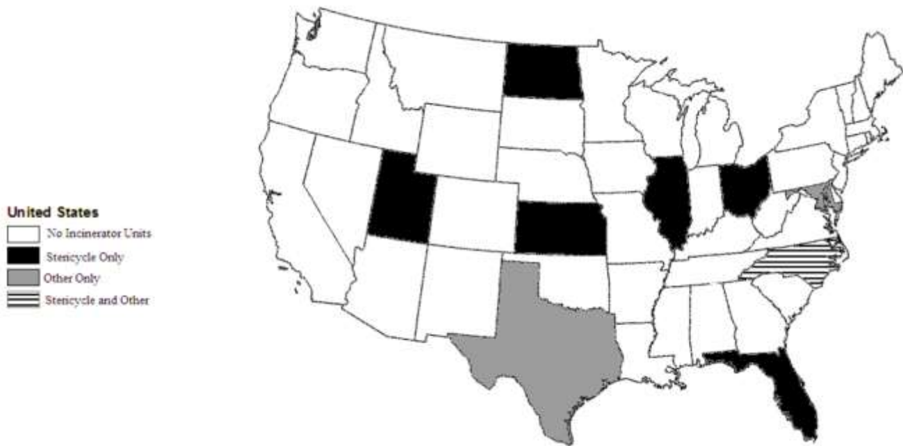
Figure 2-4. Regional Distribution of Commercial HMIWI

The geographic distribution of the 14 commercial units creates market power for facilities providing commercial treatment of medical wastes. The 10 commercial HMIWI facilities are spread across nine states. The locations of the HMIWI units become an issue when hospitals take into account transportation costs associated with transferring “red bag” waste to commercial incinerator units. More often than not, hospitals will prefer to patronize nearby incinerator units that result in lower transportation costs. Consequently, these commercial facilities have market power in regions that do not have strong incineration alternatives; only North Carolina has more than one commercial HMIWI facility. Figure 2-4 illustrates the distribution of commercial incinerator units.”